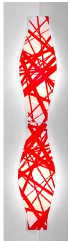
Fabric Sticks red